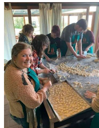
(Orvieto, the Farmers' Market and Cooking class at the Farm and)