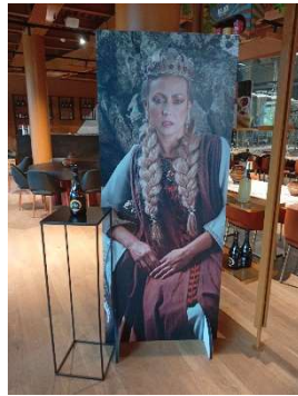
(Flea, the Brewery)