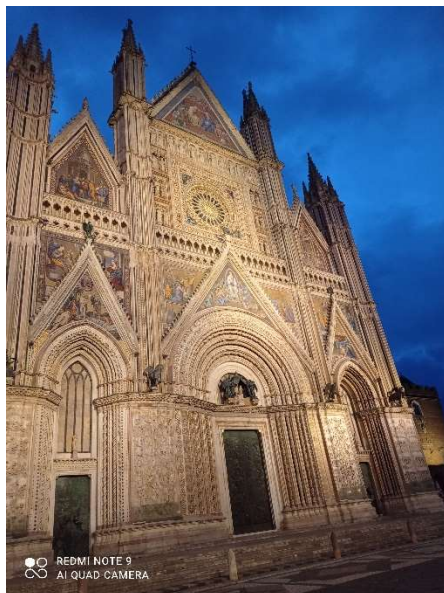
(the Duomo of Orveto)