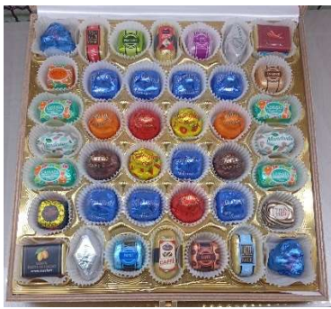
(Vannucci Chocolate Factory)