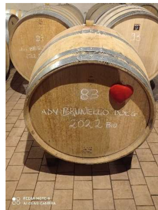
(Cantina Prime Donne)