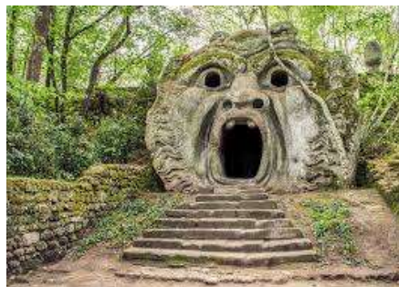
(Bomarzo, the Monster's Park)