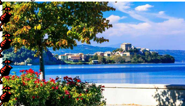
(Lake of Bolsena)