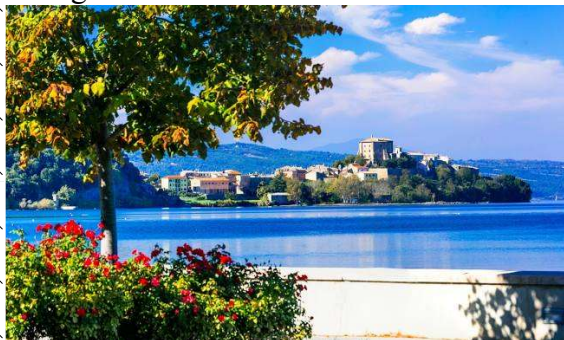
(Lake of Bolsena)