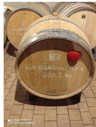
(Cantina Prime Donne)